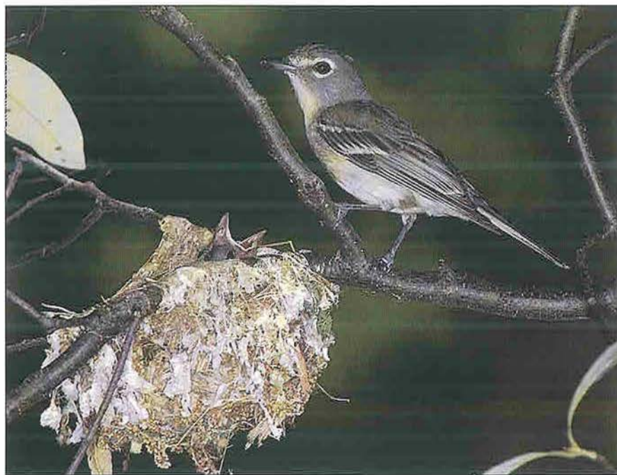
GREG R. HOMEL

Figure 5. The entirely gray and white plumage of Plumbeous Vireo ( V.s. plumbeus ) makes identification usually straightforward.