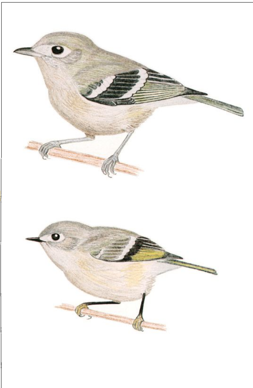
Figure 1. Two midgets. The Ruby-crowned Kinglet really is a tiny bird, while Hutton's Vireo only pretends to be; but with a poor or quick view, they can look surprisingly similar. Above: Hutton's Vireo in reasonably fresh plumage. Notice its wing pattern, with two strong white wing-bars, and a dark "panel" between them formed by the dark greater coverts. Also note the shape of the bill, and the thickness and color of the legs. Below: Ruby-crowned Kinglet in fresh plumage. Only one of its white wing-bars is really obvious, and this one is bordered at the rear by a conspicuous black band. Notice also its tiny black bill, and its thin black legs ending in yellowish feet. These two species differ in overall shape as well; Hutton's Vireo is more chunky and has a much larger-looking head for its size.

Another source of confusion, and a rather surprising one, is that Hutton's Vireo is sometimes taken for an Empidonax flycatcher. I have seen birders make this mistake a number of times. Sometimes the vireo is even identified to a particular species of Empid, which ought to earn some points for optimism, considering how hard these birds are to identify even